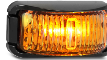
Part Number 42AM - Blister Single 42AMB - Bulk box of 10