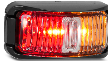
Part Number 42ARM - Blister Single 42ARMB - Bulk box of 10