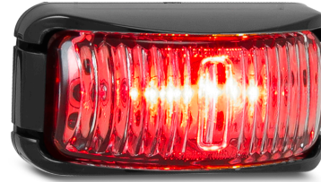
Part Number 42RM - Blister Single 42RMB - Bulk box of 10