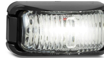
Part Number 42WM - Blister Single 42WMB - Bulk box of 10